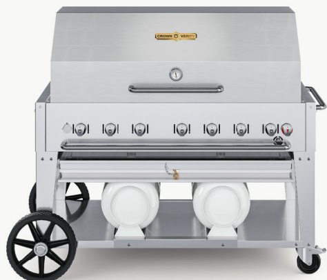
CV-CCB-48RDP model shown