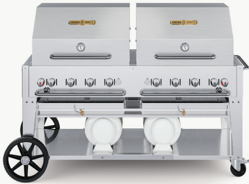
CV-CCB-60RDP model shown