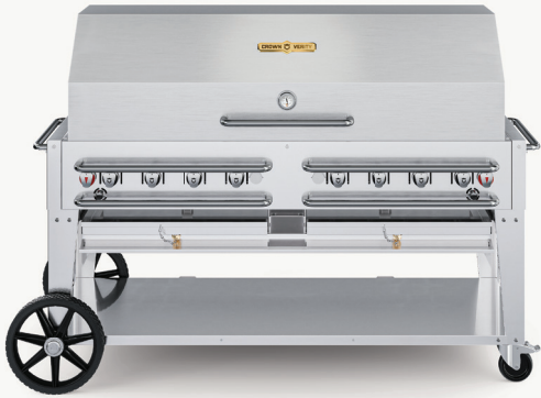
CV-RCB-60-1RDP model shown