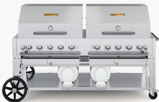
CV-CCB-72RDP model shown