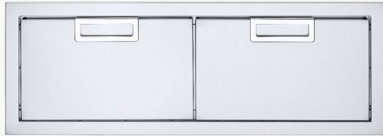
IBI30-HD model shown

Engineered to easily integrate within your cabinetry.