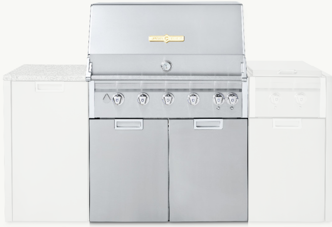
IGM36 model shown